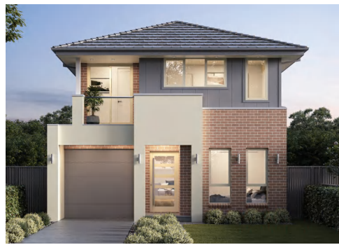
Tempo + $10,000