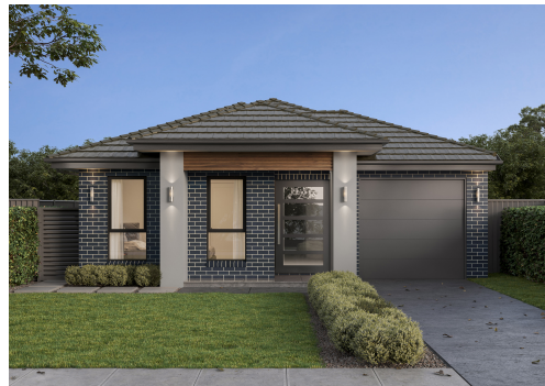
Tempo + $3,000