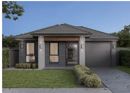
Tempo + $3,000